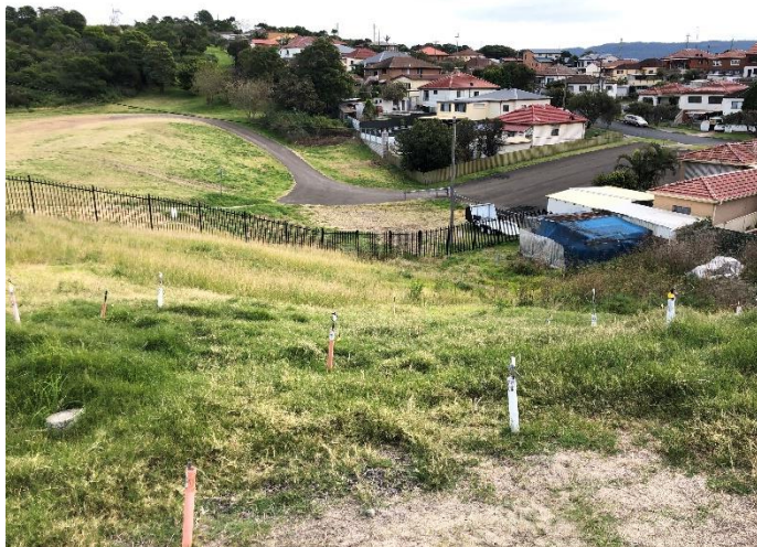
Picture 1 – Exclusion zone fencing surrounding north-western hotspot area