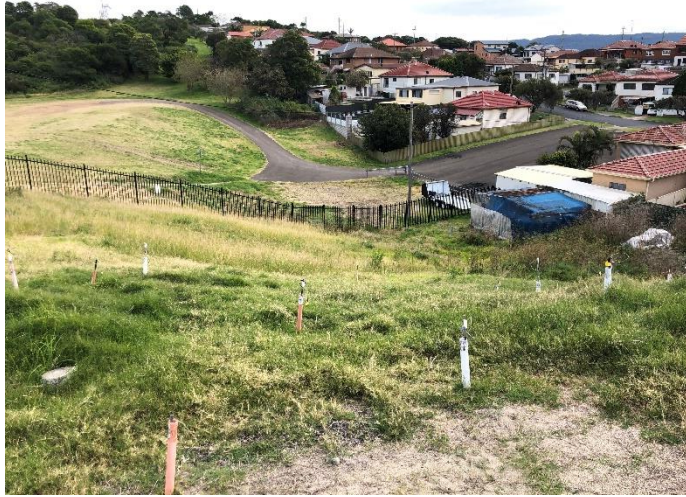
Picture 1 – Exclusion zone fencing surrounding north-western hotspot area