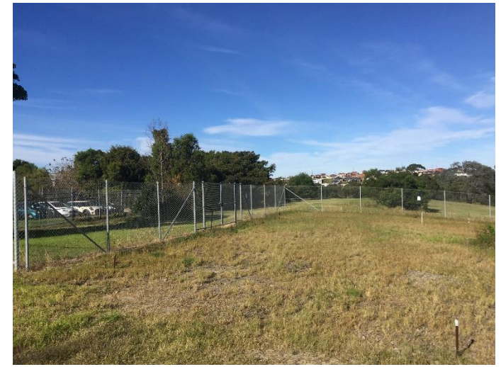
Picture 4 – Exclusion zone fencing surrounding north-western hotspot area