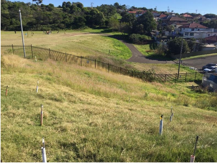
Picture 1 – Exclusion zone fencing surrounding north-western hotspot area