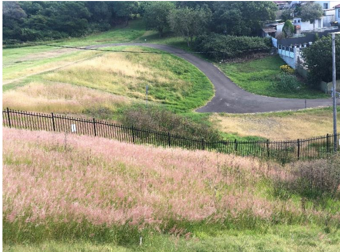
Picture 1 – Exclusion zone fencing surrounding north-western hotspot area