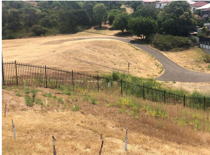
Picture 1 – Exclusion zone fencing surrounding north-western hotspot area