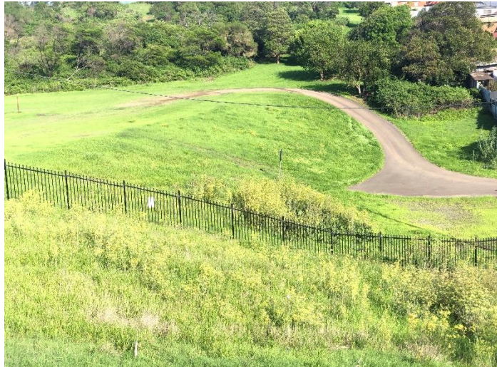
Picture 1 – Exclusion zone fencing surrounding north-western hotspot area