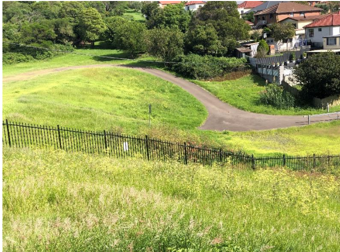
Picture 1 – Exclusion zone fencing surrounding north-western hotspot area