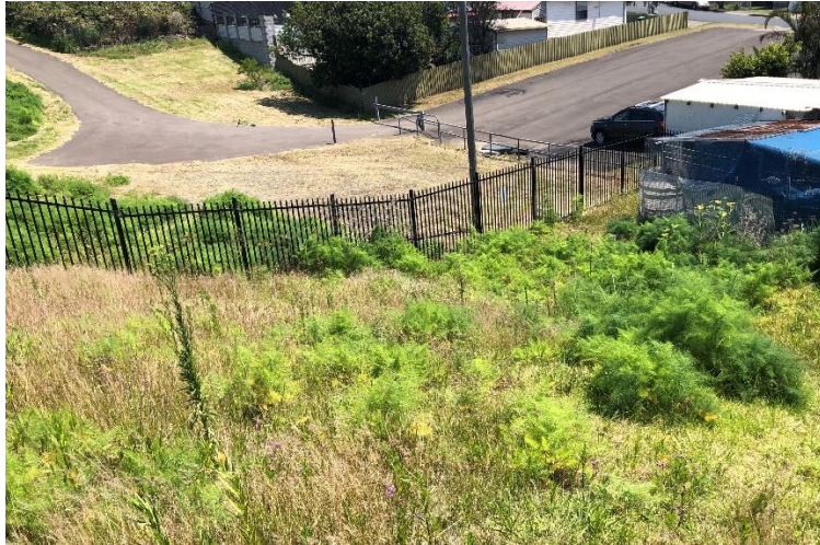
Picture 1 – Exclusion zone fencing surrounding north-western hotspot area