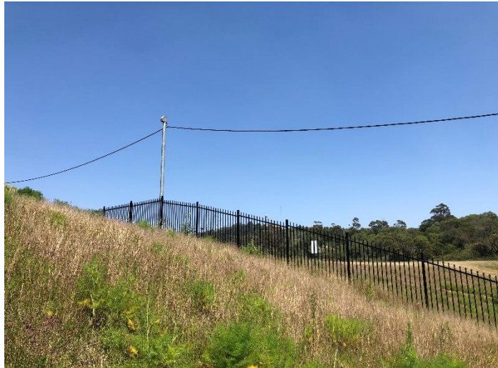
Picture 1 – Exclusion zone fencing surrounding north-western hotspot area