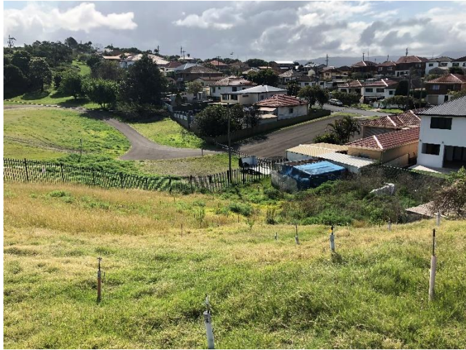
Picture 1 – Exclusion zone fencing surrounding north-western hotspot area