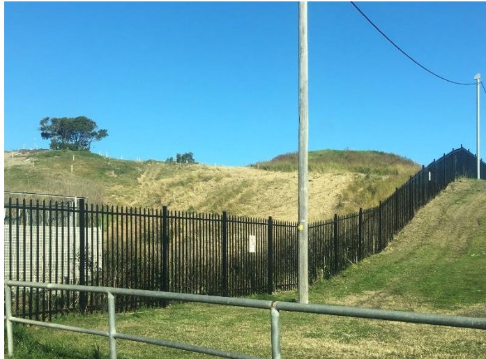
Picture 1 – Exclusion zone fencing surrounding north-western hotspot area