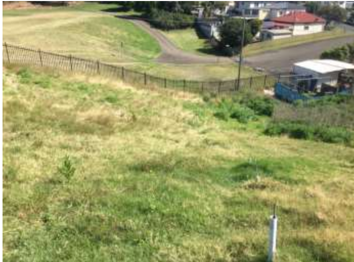
Picture 1 – Exclusion zone fencing surrounding north-western hotspot area