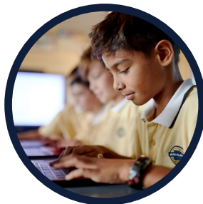
Develop life skills