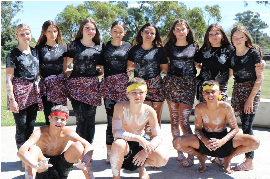
Shalvey Aboriginal Dance Group, Chifley College Shalvey Campus

Adapted from Aboriginal Language Act 2017 NSW.