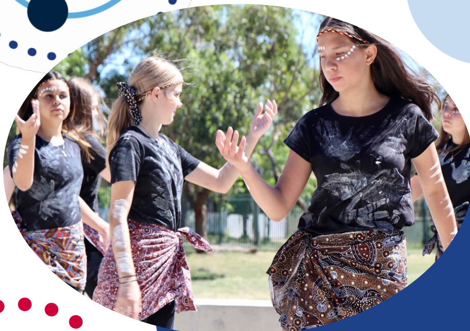
Shalvey Aboriginal Dance Group, Chifley College Shalvey Campus