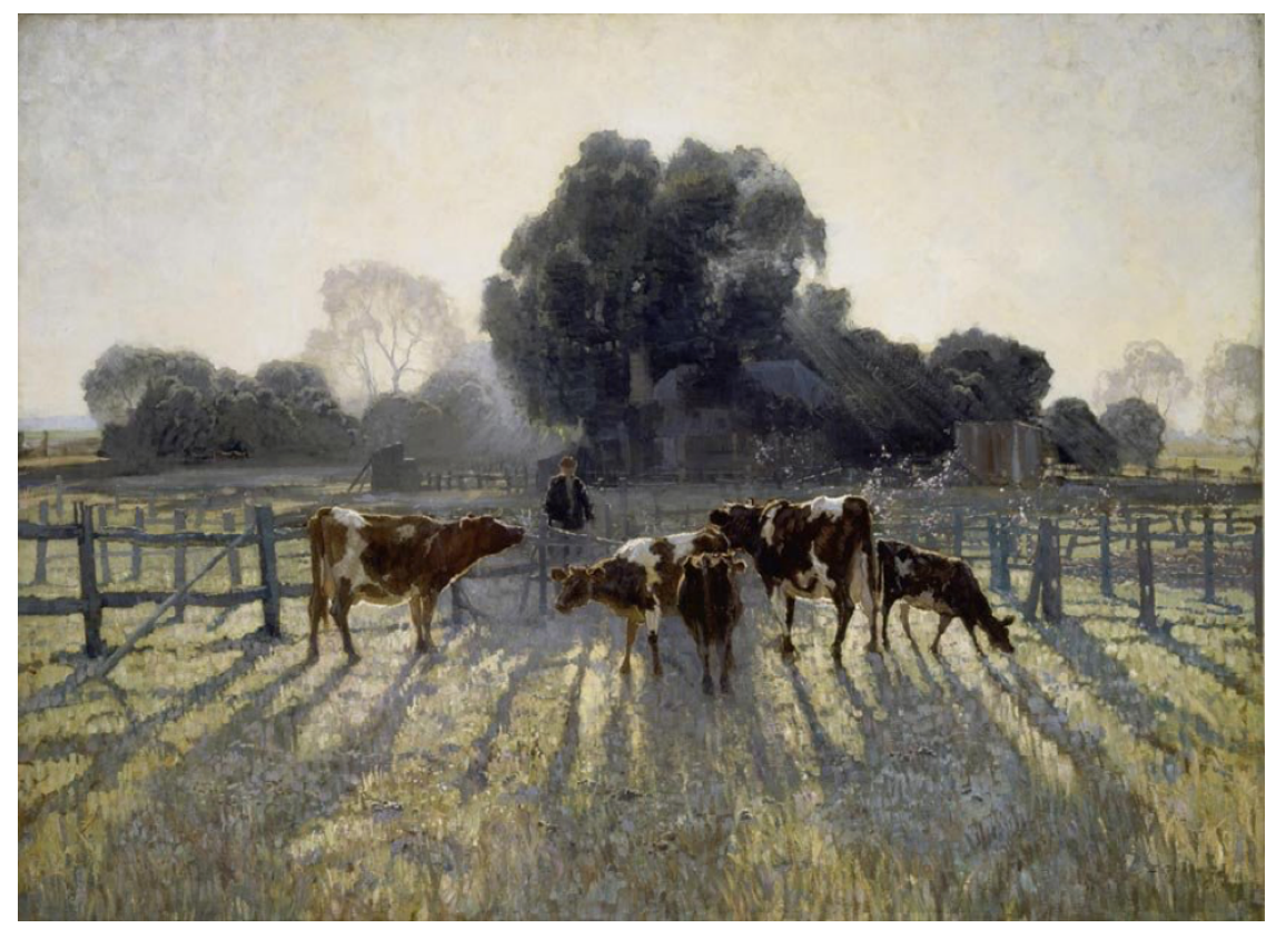
Spring Frost (1919) – by Elioth Gruner <a href="https://www.artgallery.nsw.gov.au/collection/works/6925/">https://www.artgallery.nsw.gov.au/collection/works/6925/</a>, date accessed 26/02/18.