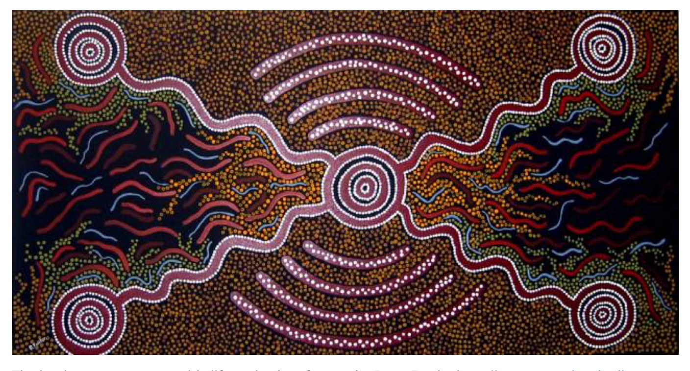
The land uses water to provide life and colour for us – by Peter Fowler <a href="http://www.artandsoulgallery.com">http://www.artandsoulgallery.com</a>. au/prod764.htm, date accessed 26/02/18.