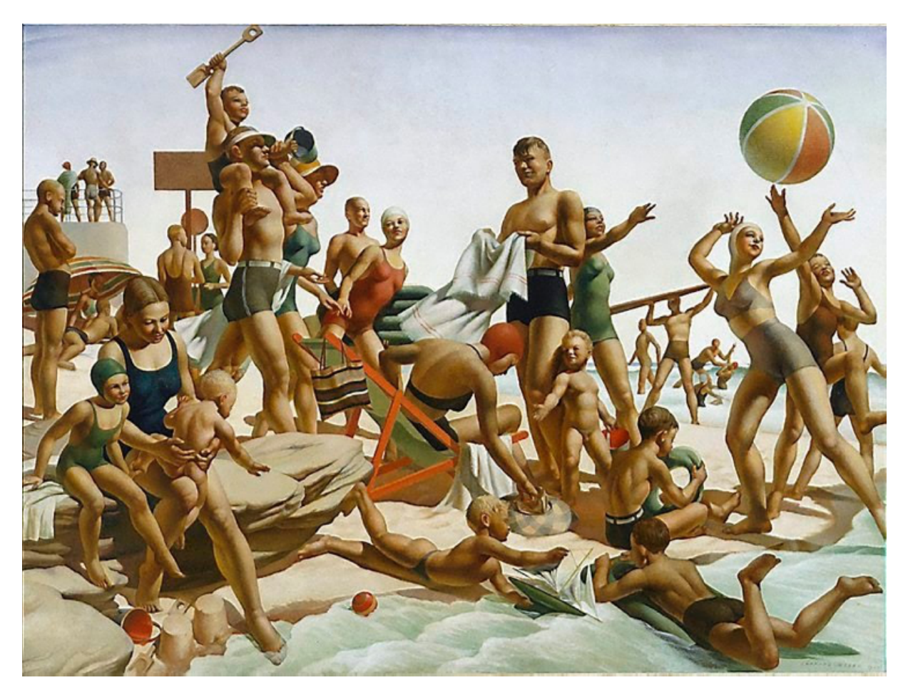
Australian beach pattern (1940) – by Charles Meere <a href="https://www.artgallery.nsw.gov.au/collection/works/OA20.1965/">https://www.artgallery.nsw.gov.au/collection/works/OA20.1965/</a>, date accessed 26/02/18.